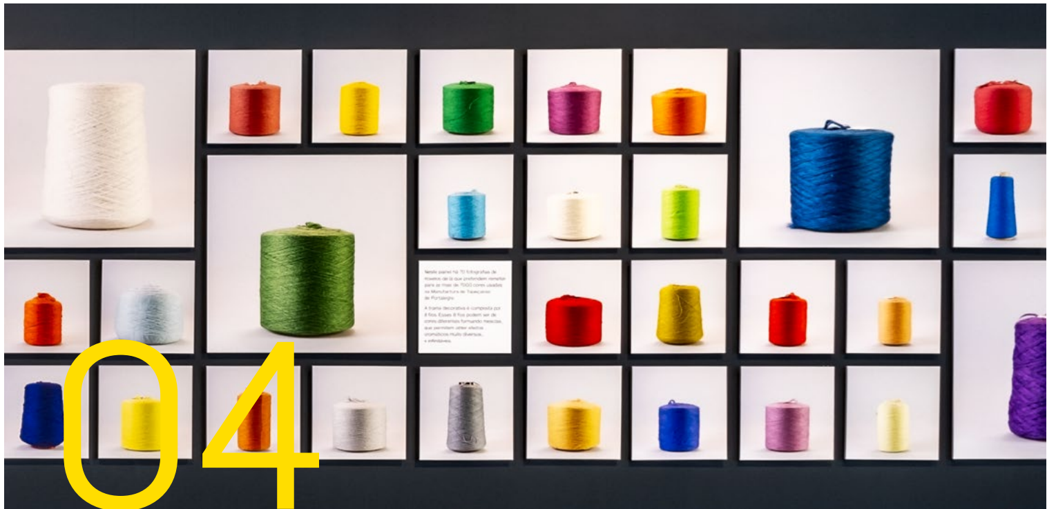
Management Report 2024